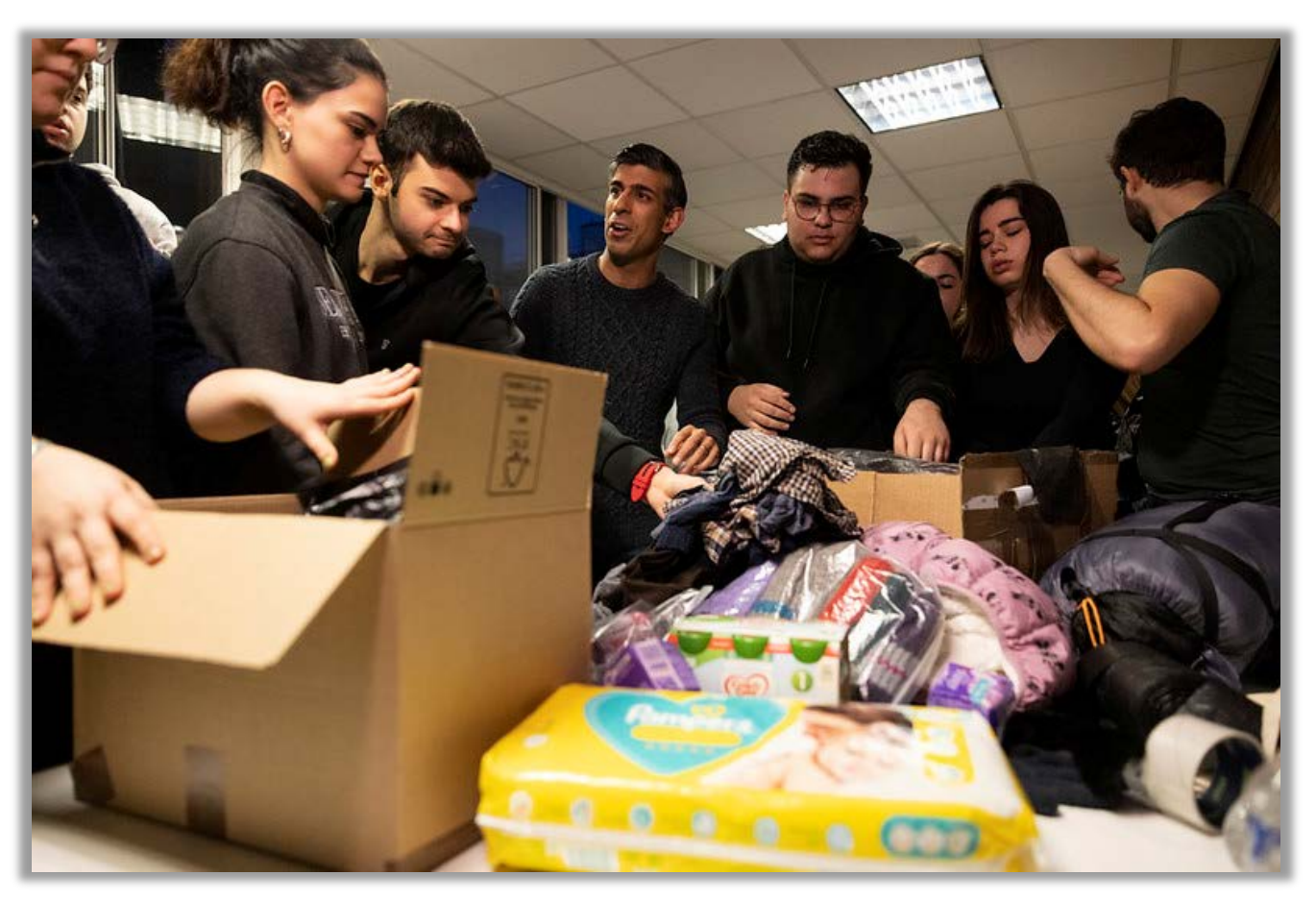
On 09/02/2023, Prime Minister Rishi Sunak visited donation centre for earthquake run by the Turkish Society at University College London