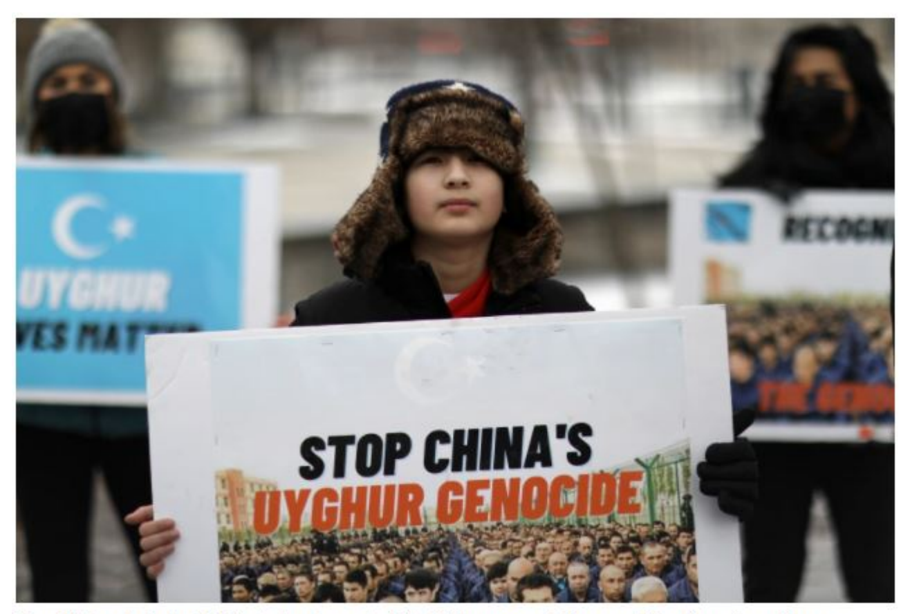
The US has labelled China's treatment of its Uighur population and Muslim minorities as genocide