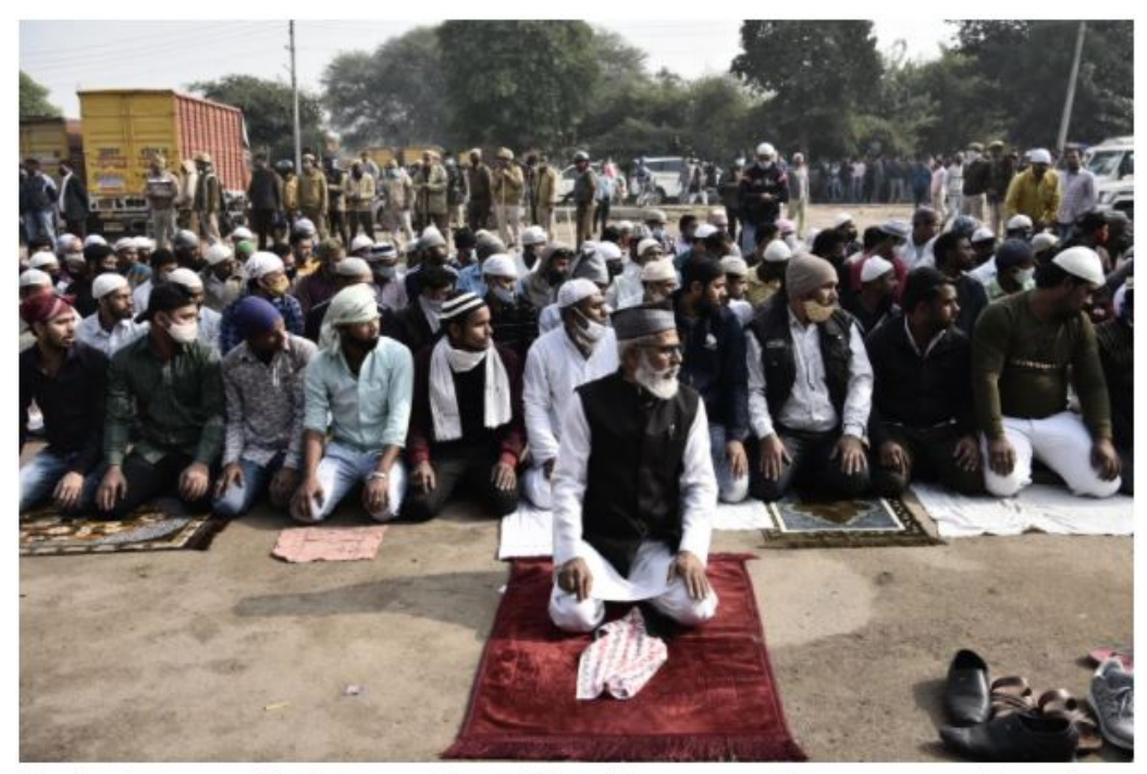
Muslim devotees offer Namaz at Sector 37 parking area amidst protests, on December 3, 2021 in Gurugram, India