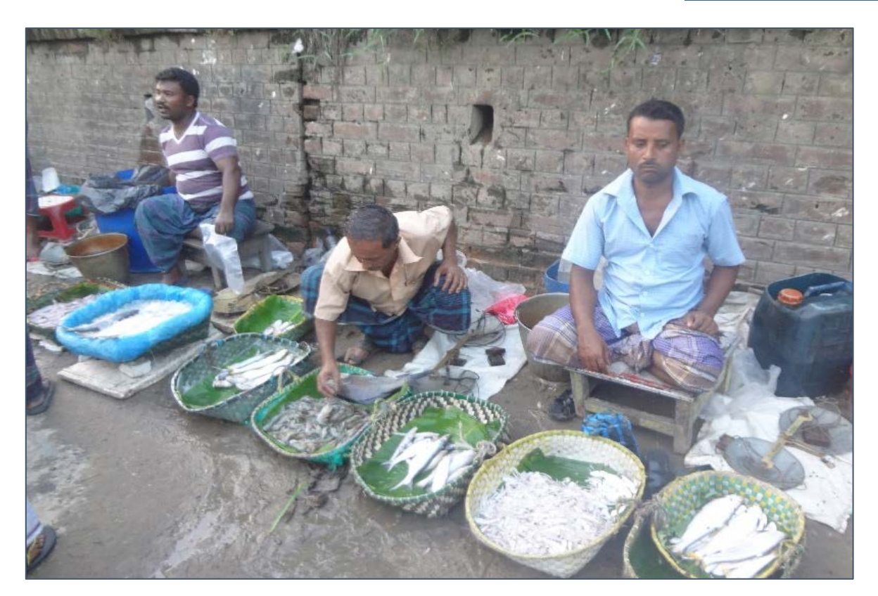
Figure 3. Local Fishmarket in Chittagong

Natural fish stock is not limitless; therefore, the country needs to focus on cultural fisheries than capturing from nature. However, the Fisheries industries booming in recent decades by using modern technologies. Aquaculture industries produce 2.4 million metric tons of fish which is more than double in 2018-2019 compared to 2008-2009 in Bangladesh. If this growth graph sustains positively, Bangladesh can earn more and more foreign currencies from this sector in the coming days. This dynamic sector has many prospects, but it also has some challenges. Sea level rise, climate change, over-exploitation from natural stock, water pollution, salinity rising in coastal areas are the main challenges for the future of Bangladesh fisheries. Many fish species become extinct from the nature stock due to over-exploitation. Industrialisation near the bank of the rivers also damages the water environment devastatingly. Immediate actions need to apply to minimise these challenges. Thus, it will help us to strengthen our fisheries sector in every aspect. Exclusively, it will help to eradicate poverty from the country.